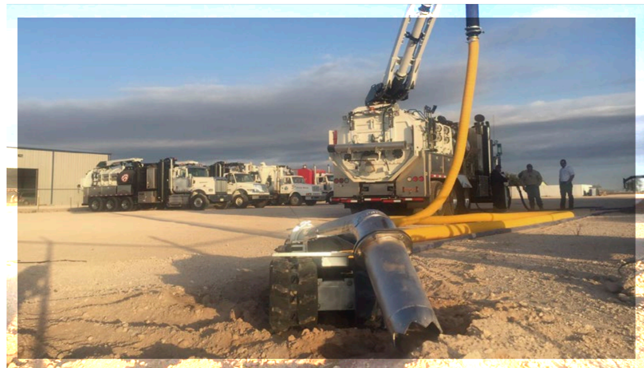
Example of Mini Excavator connected to a Vacuum Truck.

For this reason, Gerotto has created the Mini Excavators: these robots are connected to the suction hose and the operator uses a remote control to drive them, from a safe area, reducing the exposure to the risks.